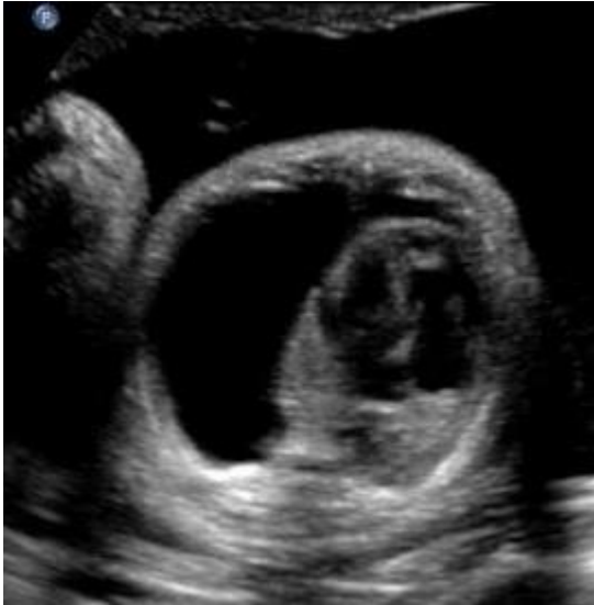
Above. Pleural Effusion