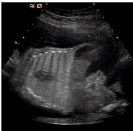
Above. Congenital High Airway Obstruction Syndrome (CHAOS)