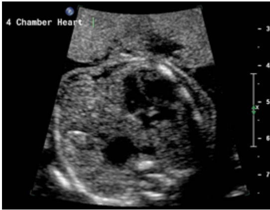
Above. Congenital Diaphragmatic Hernia (CDH)